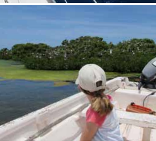
Clockwise from top: the intrepid crew on passage; visiting the Frigate Bird colony; exploring Barbuda's gorgeous Palm Beach

expected, with Vixen clicking off the 27 miles in a little over four hours, but also a little more challenging, thanks to the larger-than-expected seas and stronger winds, with gusts in the low 20s. Fortunately, as is so often the case, everyone's spirits rose quickly as their stomachs settled down once we were sailing in flat water again.